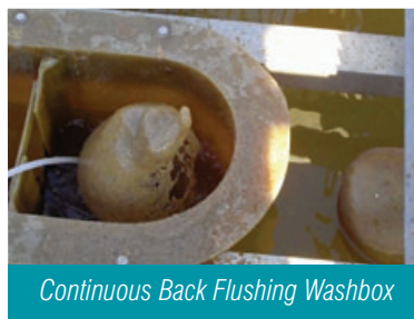
Continuous Back Flushing Washbox

With no moving parts, no screens, no level controllers or valves, the GSF offers a low operation and maintenance costs. Only air is required to operate the airlift pump. Typical air consumption ranges from one (1) to four (4) SCFM at forty (40) PSI per airlift. Recommended Operator attention and service is all that is necessary.